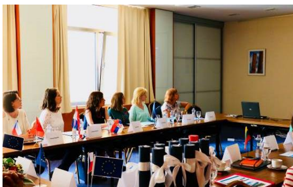
Group photo of participants of the Opening Ceremony of FIP7 EUROAGEISM H2020 program in hotel Tatra, Bratislava, 28 th – 29 th June, 2018: