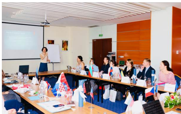
Photos from FIP7 meeting of the EUROAGEISM H2020 project, 28- 29 th June 2018, hotel Tatra, Bratislava: